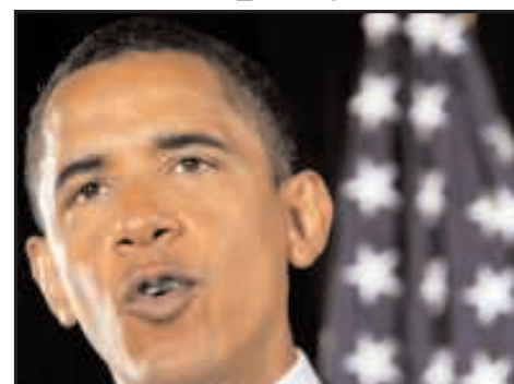
Barack Obama, US Democratic presidential candidate

A flurry of energy proposals from presidential candidates and lawmakers has come after crude oil futures prices reached $119.93 a barrel on April 28. Retail gasoline prices hit a record $3.603 a gallon this week, according to the U.S. Energy Department. Obama's Proposal Among the options Illinois Senator Obama is mulling is imposing a 20 percent tax on the cost of a barrel of oil above $80, said Grumet, who spoke at a conference in Washington today. "The industry has profited greatly