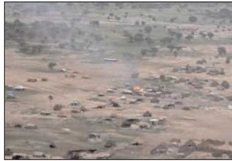
An aerial view showing fire at the village of Abyei, Sudan, which is seen mostly burned down Friday, May 23, 2008, and looters roam the village freely, after days of fighting last week. The town, contested by north and south Sudan for its oil resources and grazing fields, has been deserted after fighting raged for days between Sudan armed forces and the army of former southern rebels last week. U.N. officials say up to 90,000 people have been displaced from Abyei and neighboring villages.

The U.N.'s Qazi said the two sides have not been able to reach a compromise on a number of issues related to the peace deal, primarily Abyei. He called on them to take "tough decisions." "We can see that with any one issue, with Abyei in particular, if violence flares up it could easily spread to other areas and easily threaten the whole" peace deal, he said.