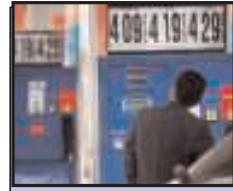
A driver puts fuel in his car at a gas station where prices have gone past $4 per gallon in Douglaston, New York. Lawmakers passed a veto-proof bill attempting to guarantee that oil prices will reflect supply and demand economic rules.

The administration said less oil going to refineries would limit available gasoline supplies and raise fuel prices. Foreign investment in U.S. oil infrastructure has declined in the last decade. But the state-owned oil companies of several OPEC nations are owners of U.S. refineries, and those investments could be affected if the legislation becomes law, said Arlington, Virginia-based FBR Capital Markets Corp. The bill also requires the Government Accountability Office to carry out a study on the effects of prior oil company mergers on energy prices.