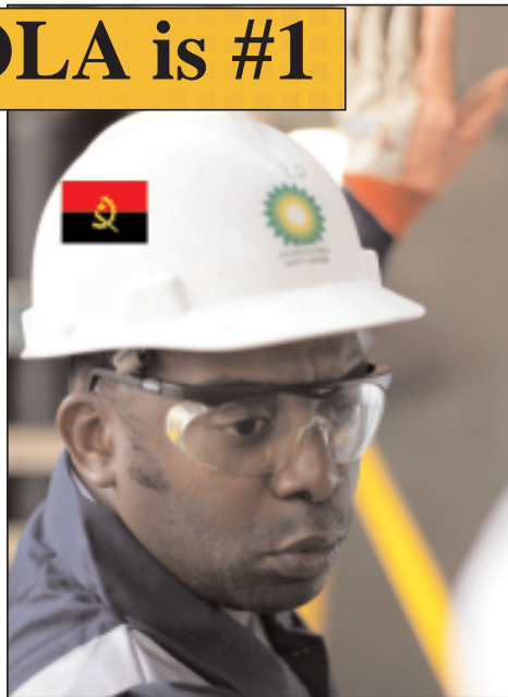
BP Angola technician at work.

In April, Angola reached a production rate of 1.92 million barrels per day (b/d), slightly below its potential of 1.93 million b/d,