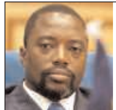
Congo President Joseph Kabila