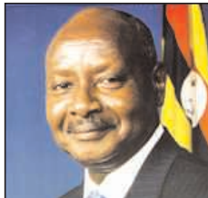
Uganda President Yoweri Museveni