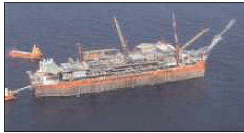
Bonga FPSO