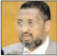
Sudan Finance Minister Zubair Ahmed al-Hassan

April 23, 2008 (London) - Mubadala Development Company is the lead bidder for a stake in Total SA's South Sudan block, with a decision due by the end of the month, the country oil minister said in an interview this week.