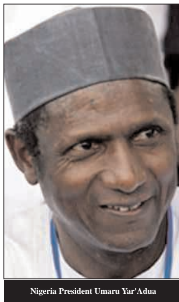
Nigeria President Umaru Yar'Adua

Bonga is the first deepwater project for Shell Nigeria Exploration and Production Co., Ltd., or Snepco, in Nigeria for Nigeria itself. It produces over 200,000 barrels a day. Gas from Bonga is piped to the