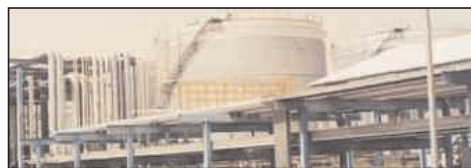
Sudan refinery in Khartoum

Sudan-based industry sources and stakeholder CNPC said in its website. The newer part of the refinery is closing for maintenance on Thursday, while the older plant completed its regular shutdown