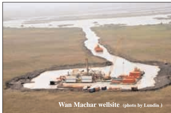
Wan Machar wellsite

The partners in Block 5B are Petronas Carigali White Nile (5B) ("Petronas") (39%), Lundin Petroleum (24.5%), ONGC Videsh (23.5%) and Sudapet (13). Furthermore, the partnership has accepted the recommendation of the National Petroleum Commission to assign a 10 percent share to the National Oil Company of Southern Sudan to be allocated on a "pro rata" basis