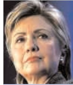
Hillary Clinton, runner for Democratic presidential nomination