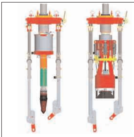
(Left) TorkDrive Compact with internal tool.