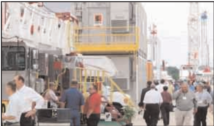
Outdoor exhibits showcased drilling rigs and components for inspection.