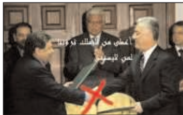
Egyptian Oil Minister Sameh Fahmi and the Israeli Minister of Infrastructure Binyamin Ben Eliezer

Under the contract, Egypt is committed to pump 1.7 billion cubic meters of natural gas a year into Israel. For the opposition, the deal is another blow