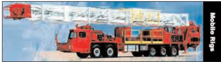
One of the many oil industry products from National Oilwell Varco.