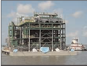
Shell's Awoba plant on the Sambreio River in the Niger Delta

May 10, 2008 -- PORT HARCOURT, Nigeria (AFP) - Oil major Royal Dutch Shell said Saturday it was losing the equivalent of 30,000 barrels of crude oil per day because of recent attacks against its installations in Nigeria. The unrest in Nigeria, Africa's biggest oil producer, helped drive oil prices to a record high above 126 dollars on Friday, analysts said.