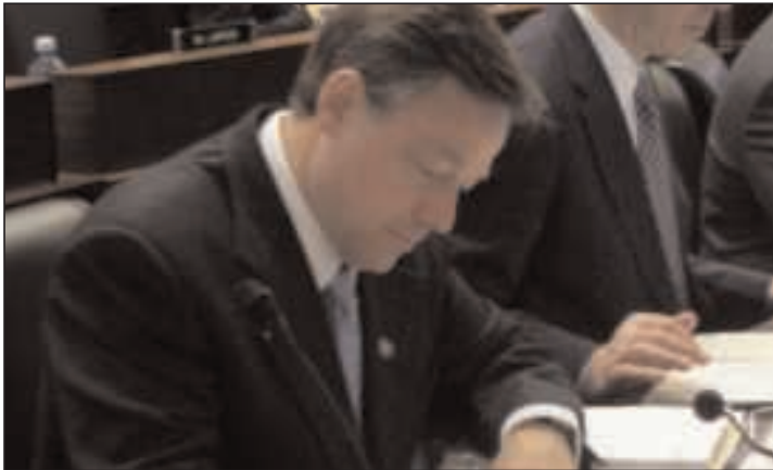
U.S. House of Representative Steve Kagen

Washington - (Reuters) The U.S. House of Representatives overwhelmingly approved legislation on Tuesday allowing the Justice Department to sue OPEC members for limiting oil supplies and working together to set crude prices, but the White House threatened to veto the measure.