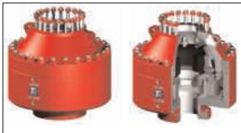
T-3 Blowout Preventer (BOP)

HOUSTON, May 12, 2008 (PRIME NEWSWIRE) -- T-3 Energy announced today that it has received a letter of intent for the purchase of two packaged pressure control systems to be included on new jack up rigs destined for West Africa.