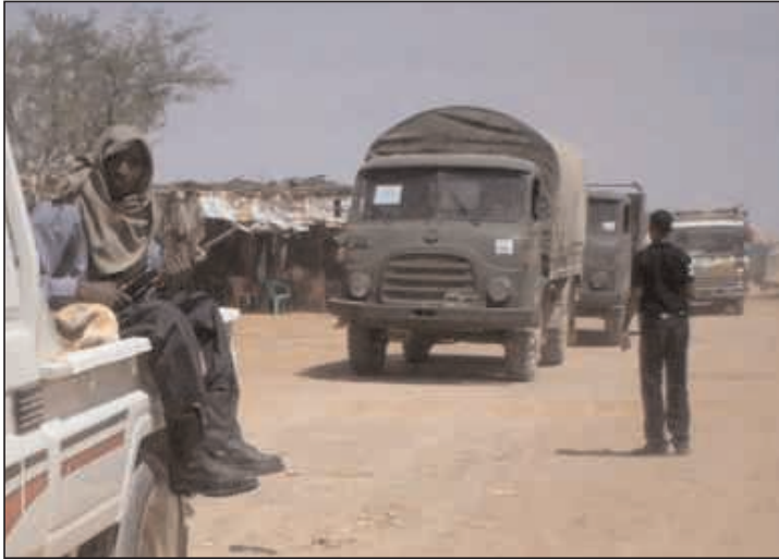
Oil company equipment was delivered by heavily-armed militia.

BOSSASO, Somalia May 21 (Garowe Online) - Two foreign companies with rights to explore for oil in northern Somalia have established a private militia force to help protect assets, Garowe Online reports.