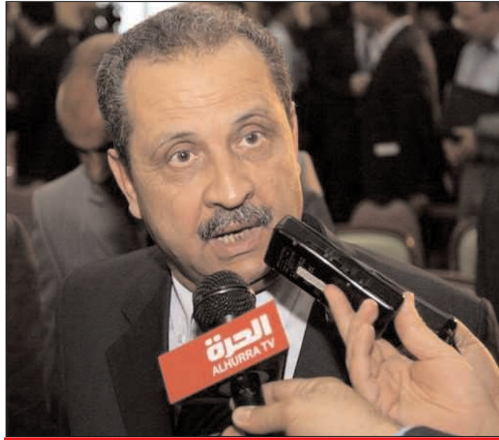
Dr. Shukri Ghanem, Chairman of the Steering Committee of the National Oil Corporation

May 26, 2008 -- Libya's oil production will top around 3 million barrels a day by 2012 according to Chairman of the Steering Committee of the National Oil Corporation Dr. Shukri Ghanem, who said production, is expected to reach 2 million by the end of this year.