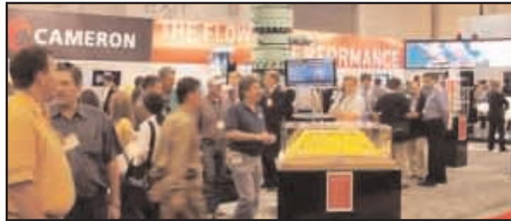
The industry's largest oil service companies were among the 2,500 companies from more than 35 countries at OTC 2008.

Founded in 1969, the Offshore Technology Conference is the world's foremost event for the development of offshore resources in the fields of drilling, exploration, production and environmental protection. OTC is held annually at Reliant Park in Houston.