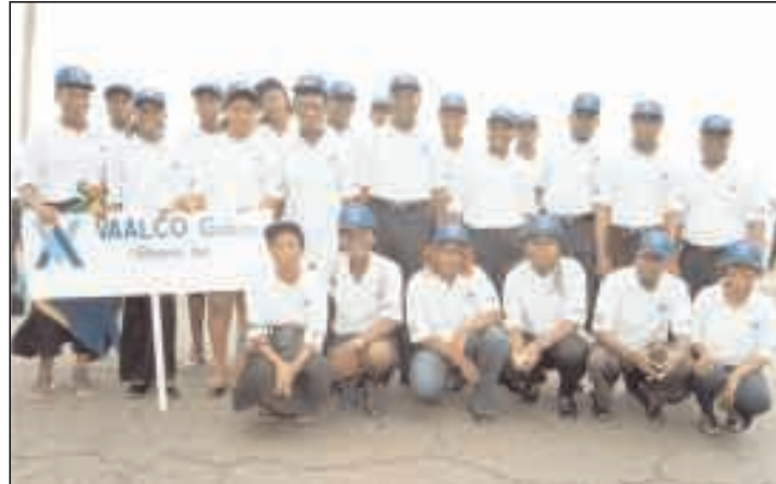
Vaalco Gabon Team Members

The first rig will be used to drill three exploratory wells; an appraisal well for possible expansion of the Ebouri development project and two additional wells on newly mapped structures. These three wells have gross reserve potential additions in excess of 60 million barrels (approximately 15 million net barrels to VAALCO). Drilling on these wells will commence in