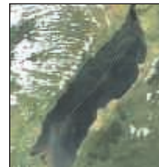
Lake Albert; the gray line is the Uganda/Congo border. (Wikipedia)

Since last year, Congo and Uganda have been embroiled in a border dispute in the Lake Albert basin, early this month, Congo accused Dublin-based Tullow Oil PLC (TUWLY) of enlisting the support of the Ugandan army to violate its borders, the Congolese government has since stripped Tullow Oil of its exploration