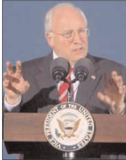
Dick Cheney, US Vice-President