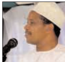
Tanzania President Jakaya Kikwete