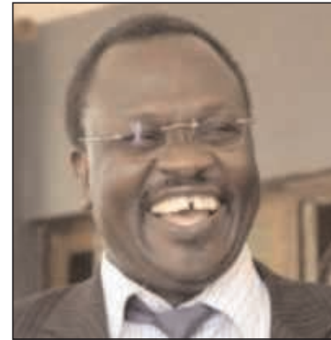
Riek Machar, Vice-President of the Government of Southern Sudan (GOSS)

May 5, 2008 (LONDON) - A US private investment company claiming rights over oil concessions in southern Sudan today said that Riek Machar, the Vice-President of the Government of Southern Sudan (GOSS), will endorse an agreement it had signed in 2004.